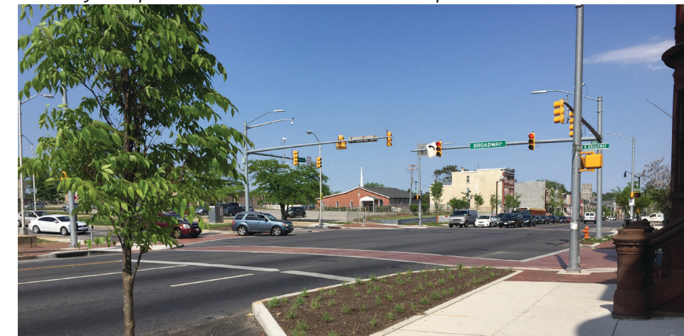
Recently completed E. North Avenue streetscape