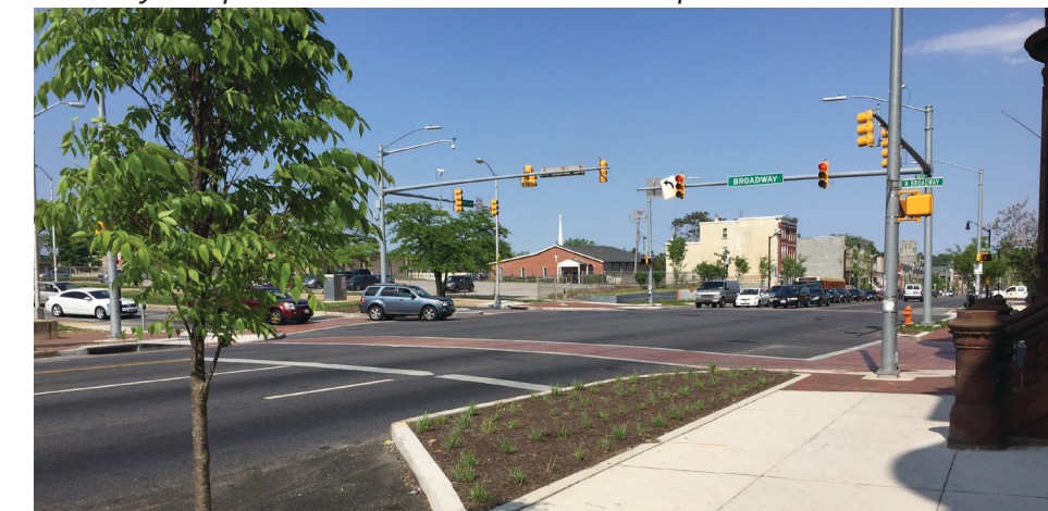
Recently completed E. North Avenue streetscape