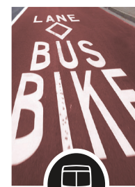
DEDICATED BUS LANES

North Avenue Rising is a joint project by the Maryland Department of Transportation Maryland Transit Administration (MDOT MTA) and the Baltimore City Department of Transportation (BCDOT) to invest in transportation infrastructure on the North Avenue corridor between Hilton Street and Milton Avenue. The revitalization effort includes: