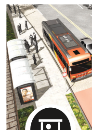
ENHANCED BUS STOPS