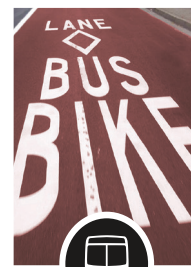
DEDICATED BUS LANES

North Avenue Rising is a joint project by the Maryland Department of Transportation Maryland Transit Administration (MDOT MTA) and the Baltimore City Department of Transportation (BCDOT) to invest in transportation infrastructure on the North Avenue corridor between Hilton Street and Milton Avenue. The revitalization effort includes: